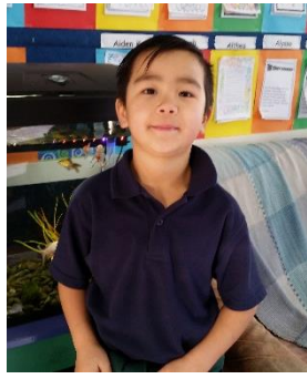
Jaycee Room 15