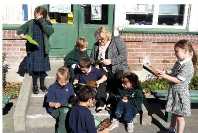
Children from Tui classes reading in the sun this morning.